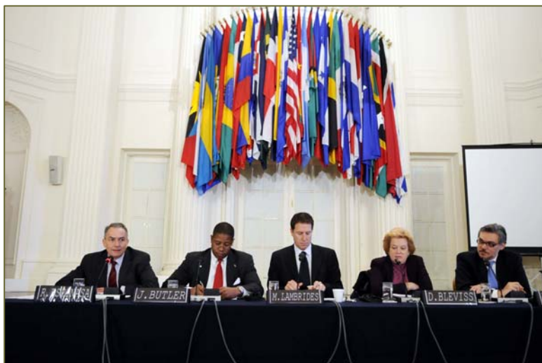
Participants in the Roundtable included: